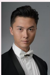
王浩信 Vincent Wong TVB人氣紅星 2013年萬千星輝 頒獎典禮飛躍進步男藝員